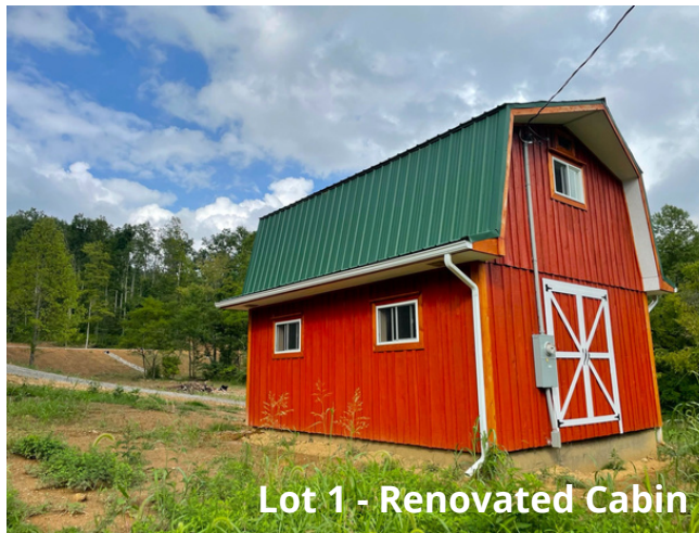
Lot 1 - Renovated Cabin