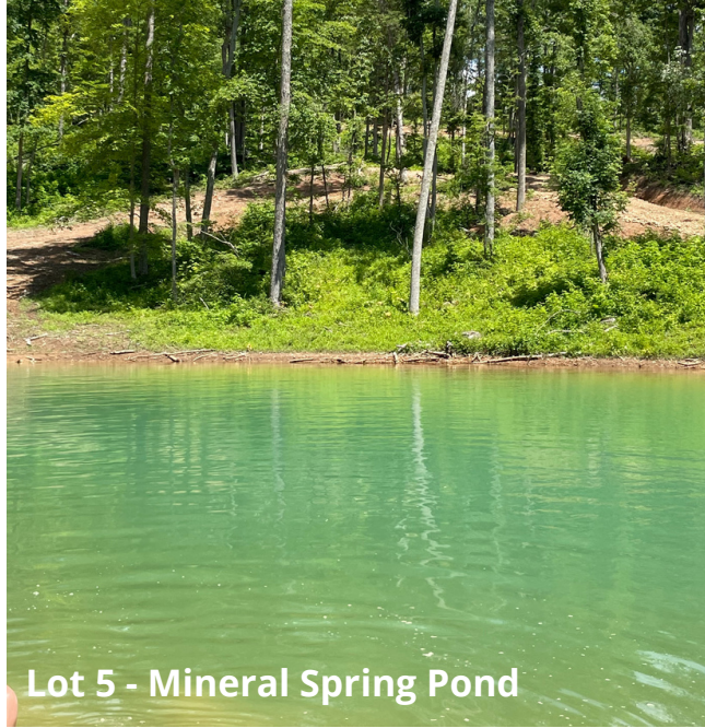
Lot 5 - Mineral Spring Pond